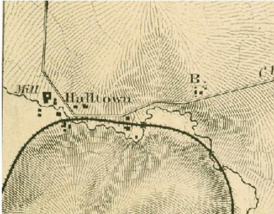
(Later map showing location of Halltown and railroad)